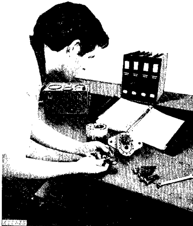
Use Technical Manuals for Actual Service

Technical Manuals are concise service guides for a specific machine. Technical manuals are on-the-job guides containing only the vital information needed by an experienced service technician.