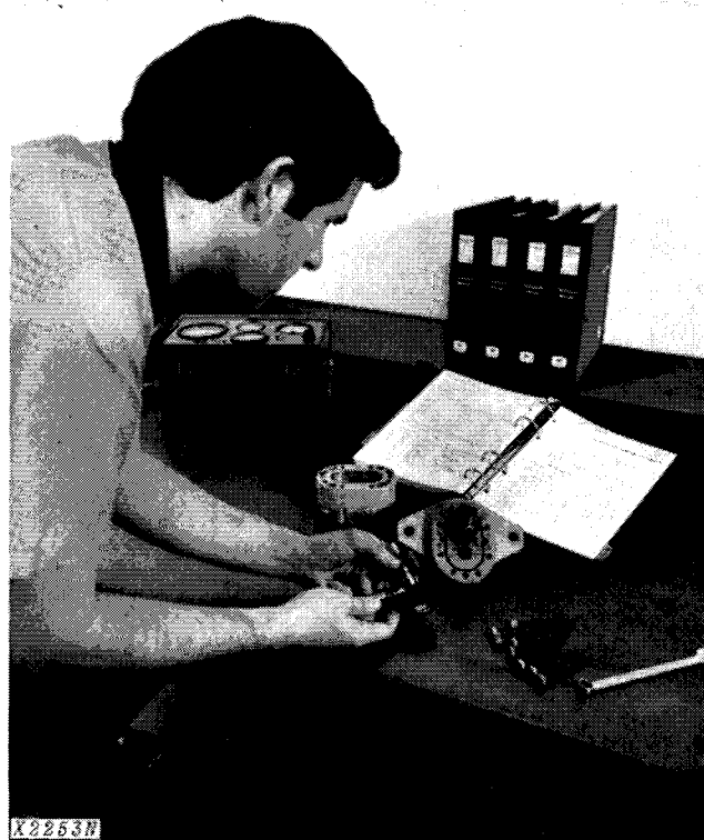
Use Technical Manuals for Actual Service

This technical manual is part of a twin concept of service: